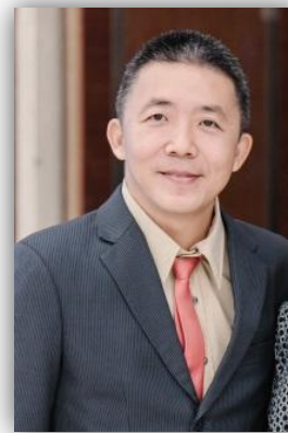
Control Engineer B.Eng. : KMITL MBA : Texas A&M , Central Texas USA