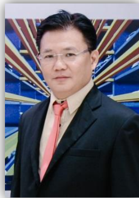
B.BA. : CU